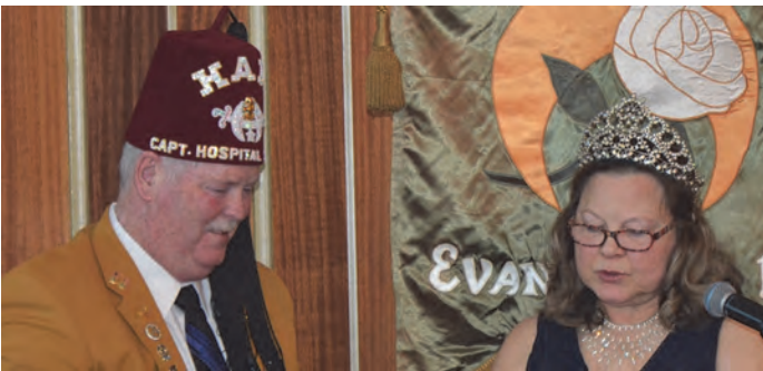
Captain of Hadi Hospital Staff Brings Greetings