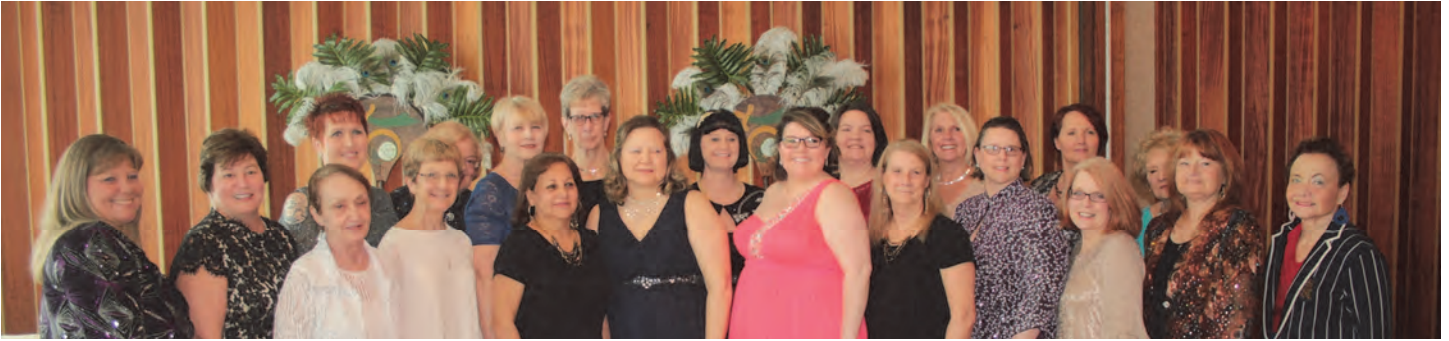
2019-2020 Isis Temple Officers