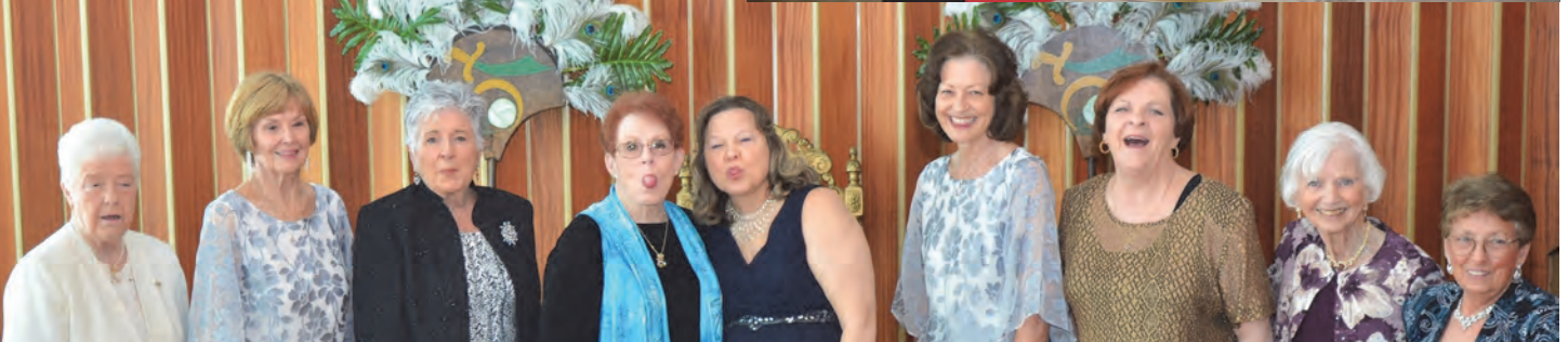
Installing Officers Having Fun!