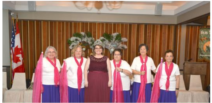
Dancers & Pageantry