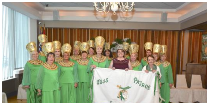
Isis Temple Patrol