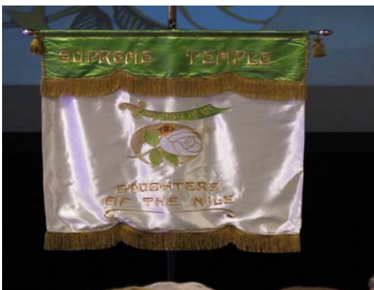
Supreme Temple Daughters of the Nile Banner