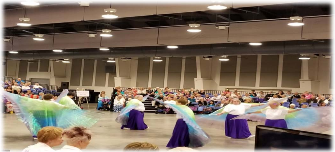
Isis Temple Dancers & Pageantry performance at the 2017 Supreme Session