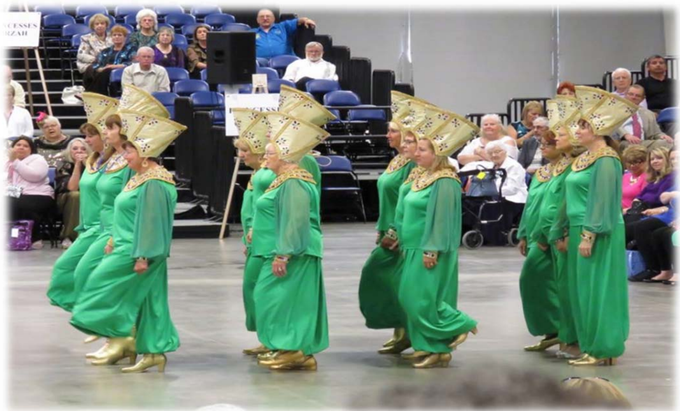
Isis Temple Patrol performing at Supreme 2017