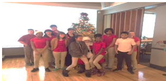
Santa and the Hadi Hospital Staff children