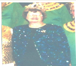
Sandy Falls Queen 1998