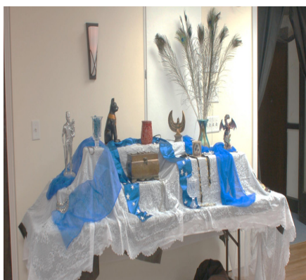
Decorations by the Dancers and Pageantry