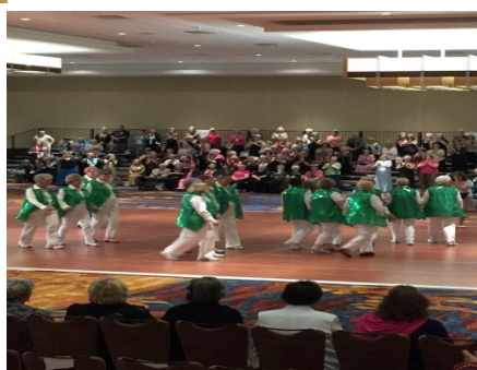
PSQ, Patrol Unit