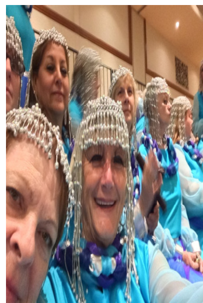
Isis Temple Egyptian Band Members, getting ready to perform